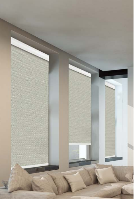
Foam Blackout Roll

Fresh colors used on the front side create a rich and lively atmosphere while Fabrics block 100% light white colors on the back side give a sense of harmony when viewed from the outside.